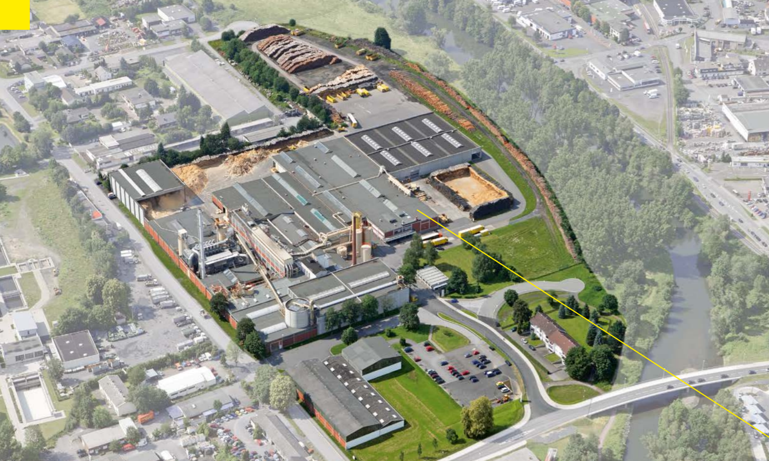
Production & Headquarters / Factory Arnsberg