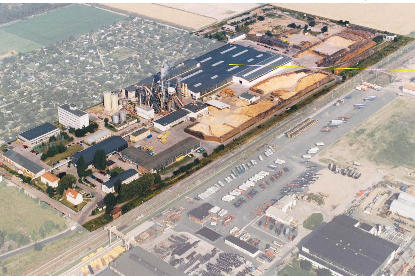
Production & Service Centre / Factory Gotha