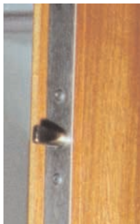
Door Frame Locking System