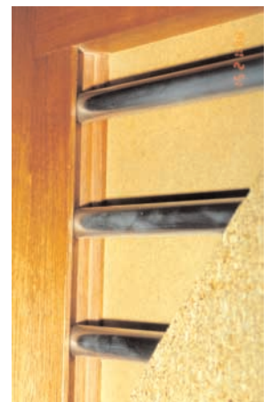
Steel Tubes fixed in the Frame