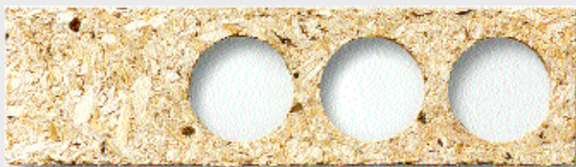
Tubeboard with solid areas